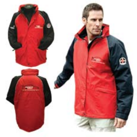
Rally Heavy Jacket