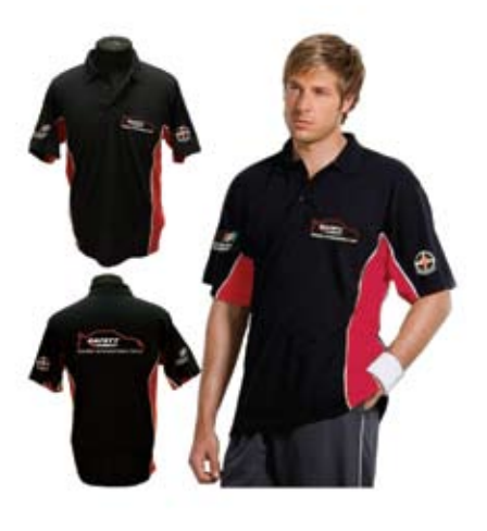
Rally Polo Shirt