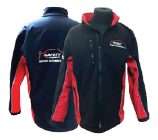
Rally Sport Soft Shell