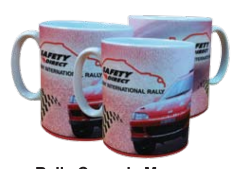
Rally Ceramic Mug