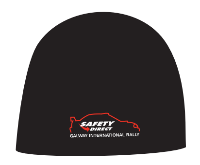
Rally Beanie Hats